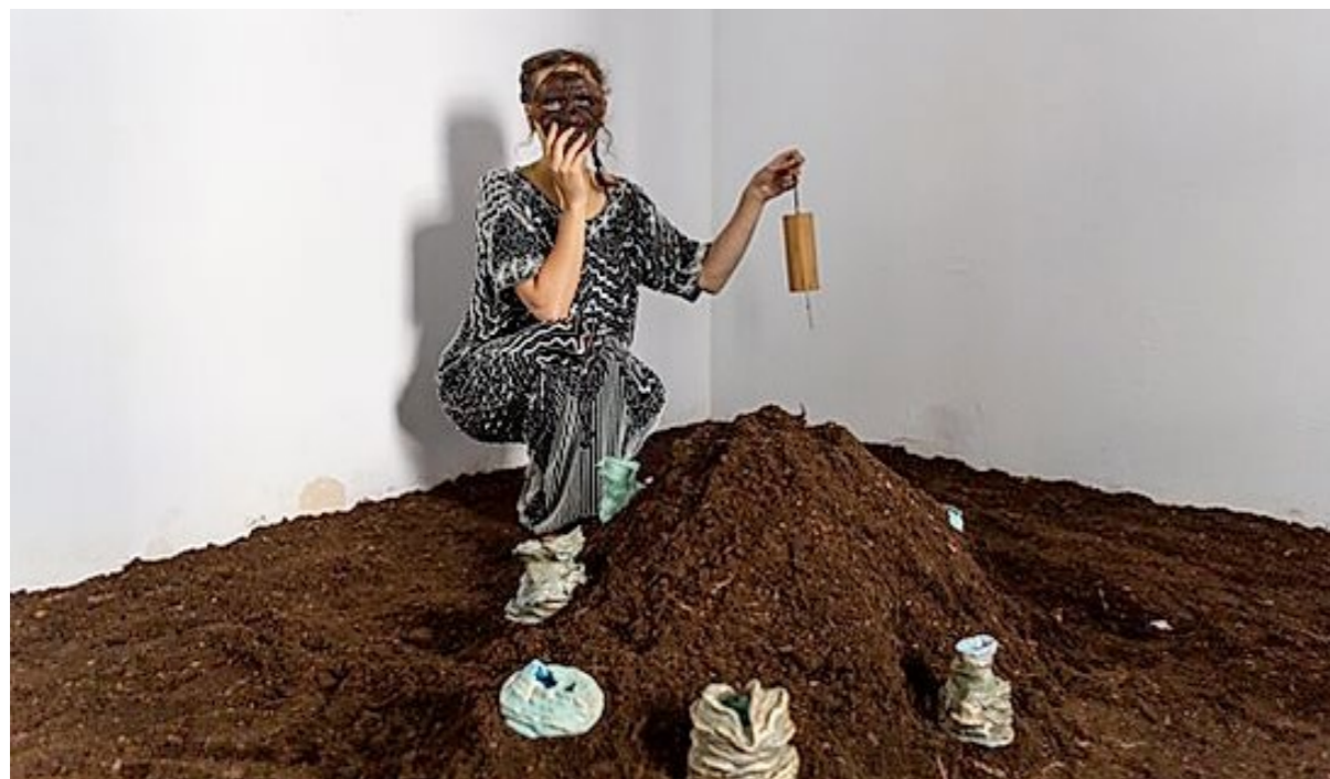
Broken Links Performance made on September 16, 2019 at the 18 th Congress of European Mycologists