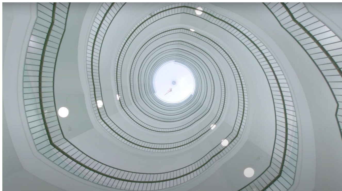
Marsquakes Video stills