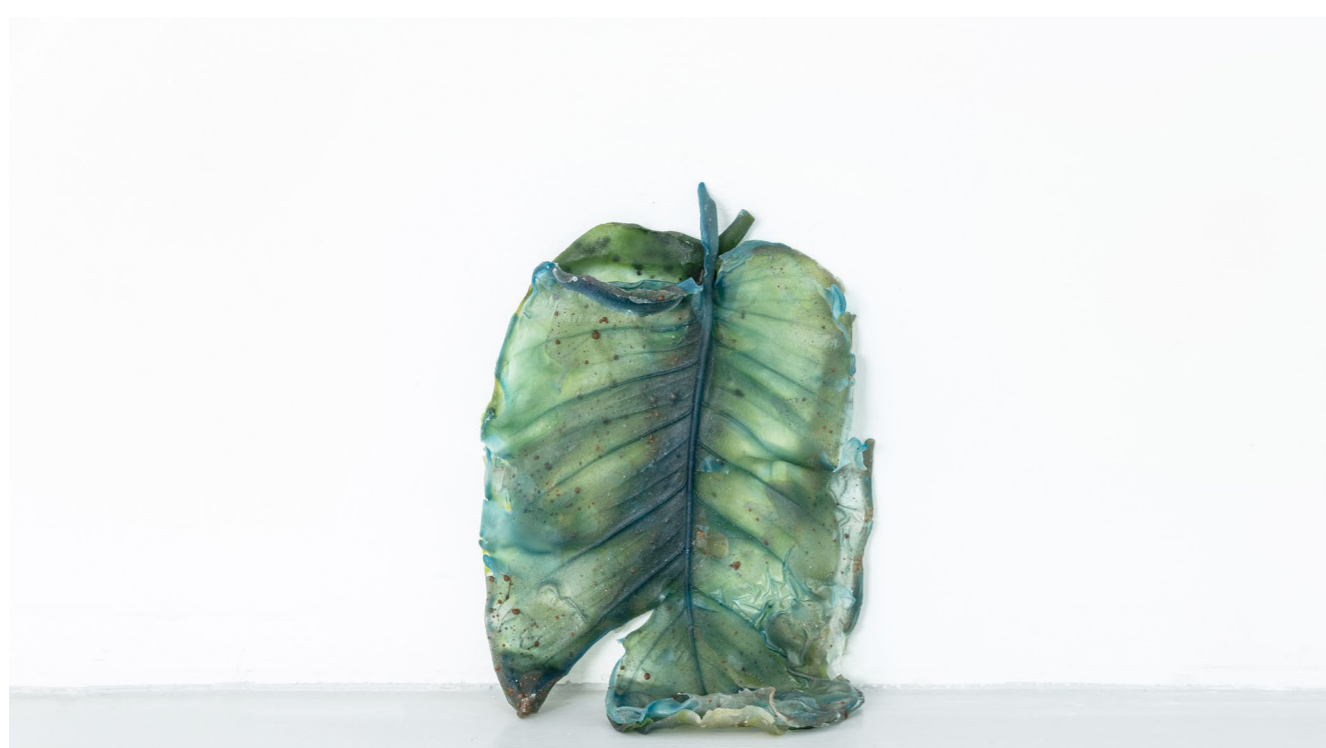
Drifting Particles Photos of the objects